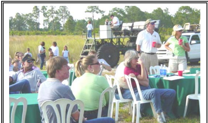
Learning about Panther Island!